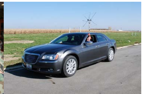
F q p " M ; P T " j w p v u " k p " D new car