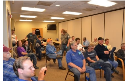
The annual auction always draws a crowd