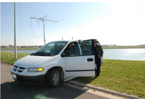
Y j c v " f q " { q w " o g c p " ð K ø m ø v ' þ ç α g m " v j w p ö " c i The winner! N9KDI n " v j g " " next time!