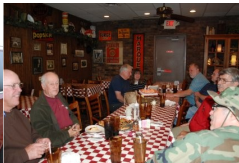
Mmmm! The post hunt pizza