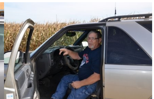
Rollie N9RJM The Winner!