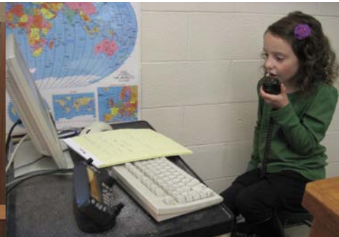
W9KVR's Harmonic S Another auction action shot at the October meeting