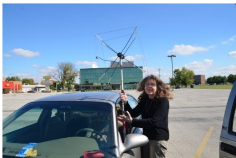
Billie K9QT sets up at the start