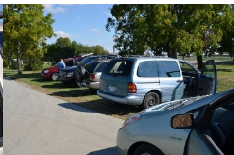
Hunters gather at the finish