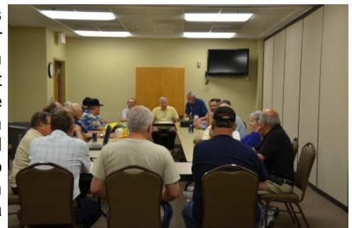
Taking care of business