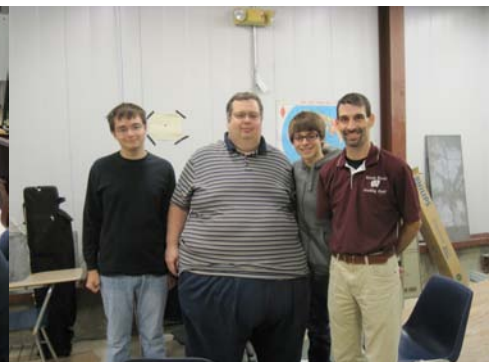
KC9TMB, WB9VPG, KC9UUS and W9KVR at the K9SOU station