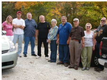
Part of foxhunt group pose for picture after October 9th hunt.