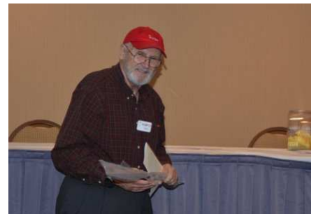
Will K9FO wins prize at W9DXCC convention