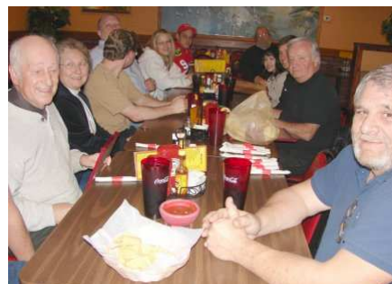
Foxhunt group swaps tales after hunt at El Campesino restaurant