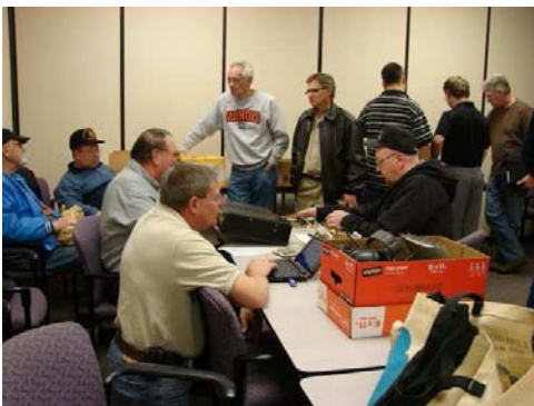
Bidders bull pen