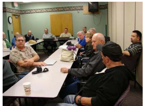
A view of the business prior to the auction