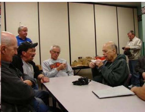
KARS members getting psyched up for the bidding action