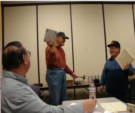
Auctioneers Will K9FO and Dan WA9WAQ in action