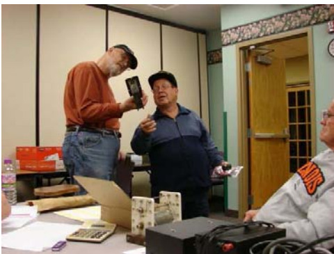
Will K9FO and Dan WA9WAQ sizing up an item for bidding