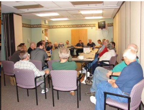
Conducting business at the October KARS Meeting