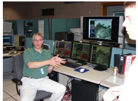
An NWS meteorologist explains the workings of one of the main control room positions where weather predictions and warnings are originated