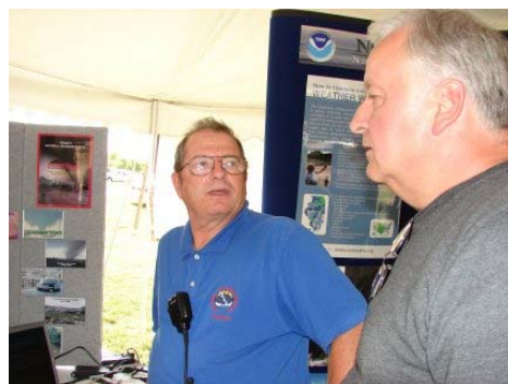
.Phil, NW9V discusses the importance of the KARS .34/.94 repeater to the NWS