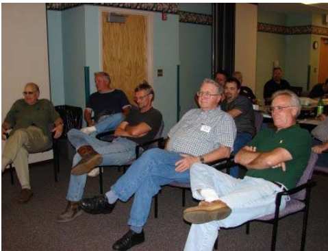
Eager bidders await the start of the annual KARS auction at the October meeting