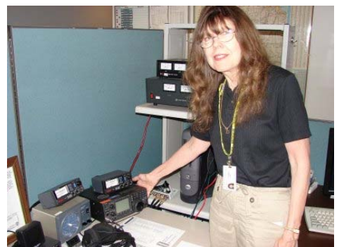
Billie K9QT at the WX9LOT operating position in the main NWS control room