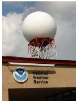
The National Weather Service Headquarters in Romeoville