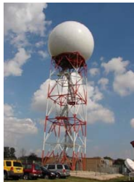
The state-of-the-art Doppler weather radar antenna