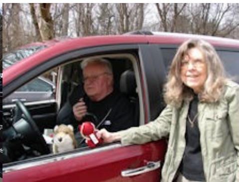
Fox K9NR is found by winner K9QT