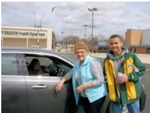
KD9HSD and N9BMB at the start