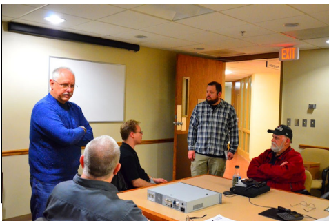
KARS members inspect one of the new repeaters at the April meeting