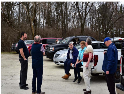
Hunters gather at the Fox's lair