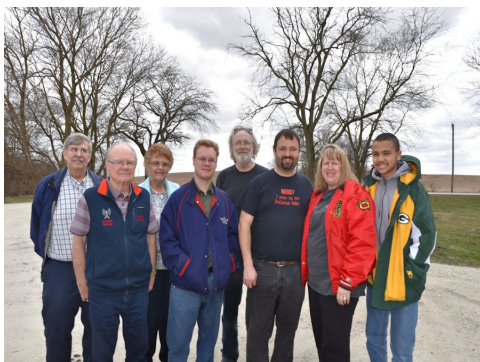
Group shot at the finish