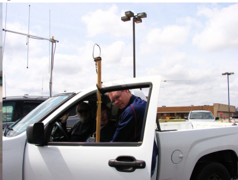
N9FD, N9DWE & KA9TAG at the start