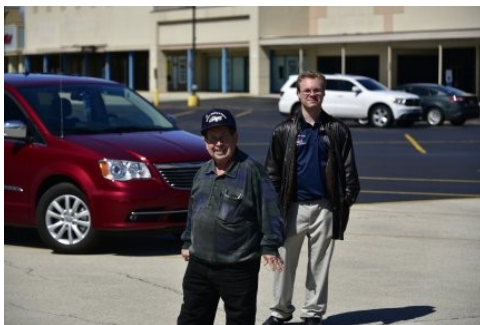
WA9WAQ & N9FD at the start