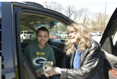
Winner K9QT with the fox N9BMB