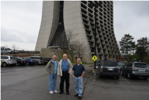
W9IE, K9CS, N9FD & K9NR (cameraman) at world famous Fermilab

The meeting was preceded by a private tour of the particle accelerator facility for about 25 lucky people and K9NR, K9CS, W9IE & N9FD were among the fortunate few!