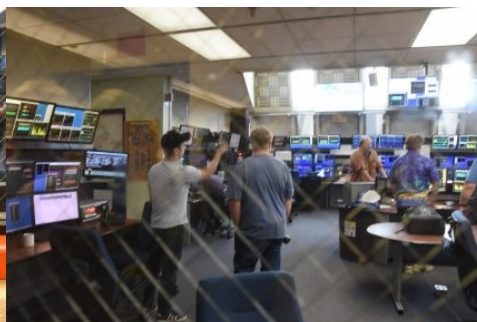
Another view of the control room