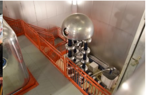
How would you like one of these in your basement?