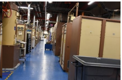
Row after row and isle after isle of control circuits, power supplies, amplifiers & klystrons supply the millions of Watts and up to a trillion Volts to the giant particle accelerator