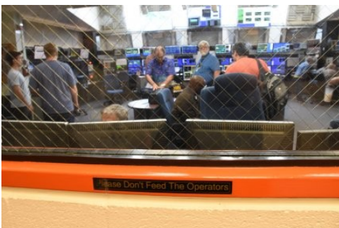
A corner of the giant control room "Please Don't Feed The Operators!"