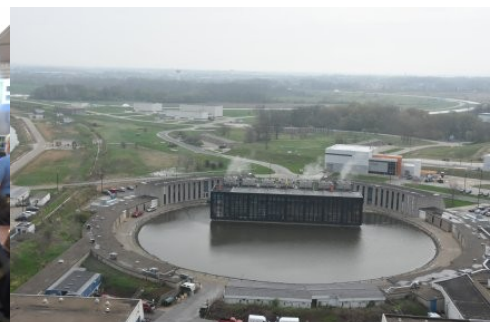
A view of part of the cooling facilities