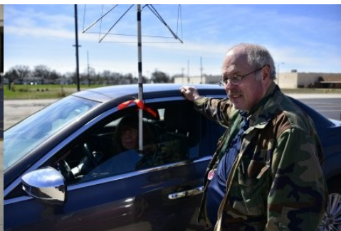
KA9MDJ talking to K9QT