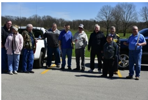
Most of the hunters at the finish