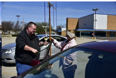
K9ABN getting help from XYL