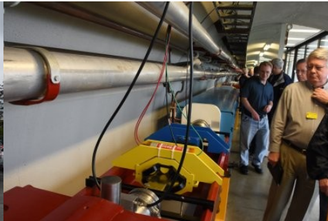
"Retired" sections of the accelerator having been replaced by upgraded gear