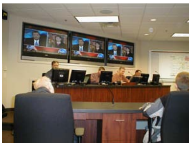
KARS holds meeting inside the command center of the EOC