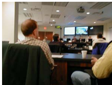
County officials hold a critique of Emergency Exercise at the new command center