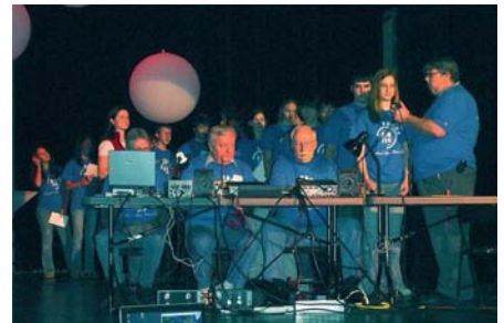
The big day Students contact the International Space Station