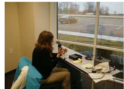
Billie, K9QT operating at county HQ during the Emergency Exercise