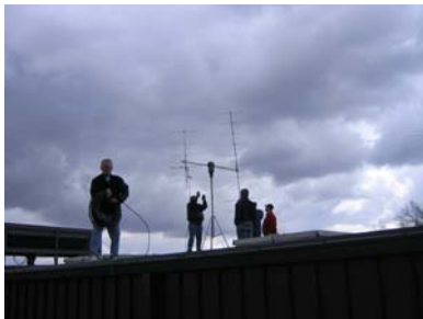
Rooftop view of the antennas used for the ARISS contact