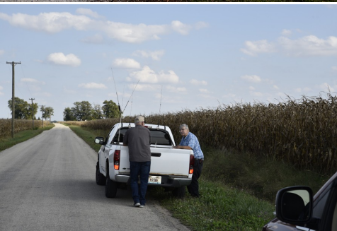
October 9 2021 -Hunters gather at the fox's lair

Like N1MM+ Logger, it can be easily downloaded and it is totally activated.