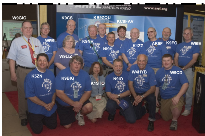
KARS members at ARRL EXPO/Hamvention2006 KARS Int Space Station contact recognized by ARRL