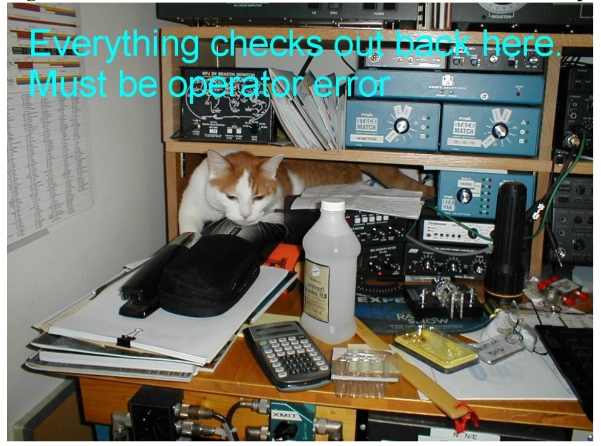
When troubleshooting in awkward places, four paws were better than two! Rest in Peace Louie