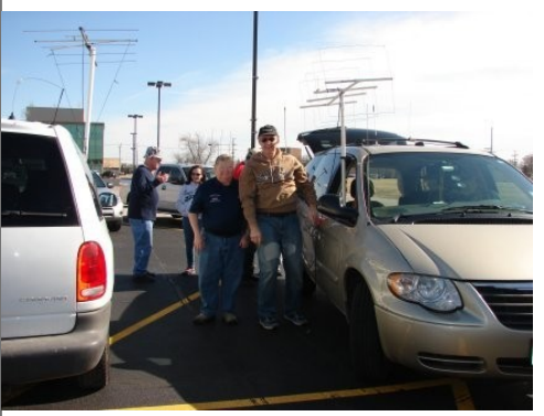
Rigging up at the start