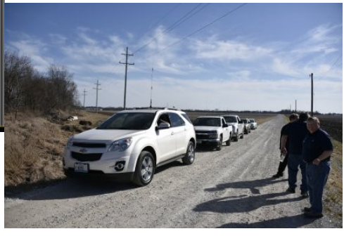
Hunters starting to arrive and lining up at the Fox's lair