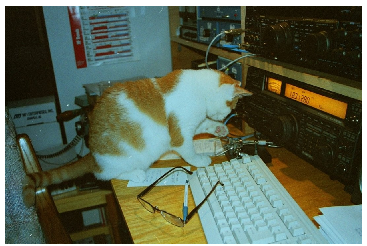
Pounding the Brass - Louie the Cat - Was The Purrrrrfect CW Operator