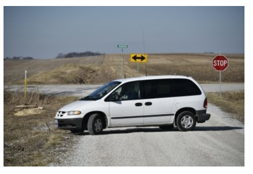
KB9VR & KA9MDJ arriving at the hidden transmitter.