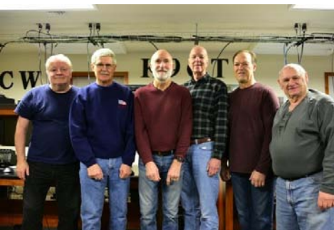
CQWW WPX RTTY Contest crew I-r K9NR, AI9T, K9CT, K9WX, N9CK, K3WA