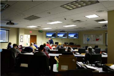
A view of a KARS Technician Class session at the Kankakee County Incident Command Center

The weekly procrastinators net has been postponed till further notice