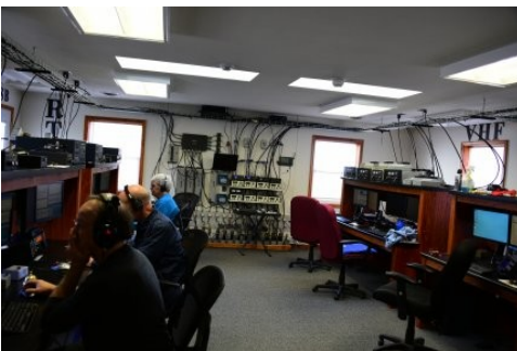
Operating positions at K9CT HF to the left—VHF/UHF to the right

Don K9NR received an invite to join the K9CT Multi-2 crew for the CQWW WPX RTTY Contest . Owned by Craig K9CT of Trivoli (Peoria area) , it is a "built from the ground up" station for Contesting and DXing. Mostly operated as Multi-2 (multiple operators but only 2 simultaneous transmitters) Craig sometimes operates Single-Op in a few contests. The operation went well with a final score of over 13,000,000 points breaking the former NA record of about 11,850,000 points