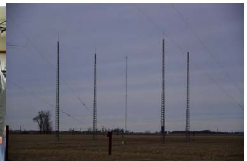
80 meter 4 Square antenna