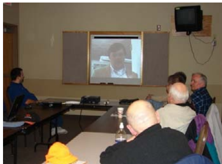
KARS members watching a video on contesting at the February meeting

If we miss your birthday or get it wrong, please let us know!