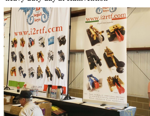
Italian Keys and paddles from Begali