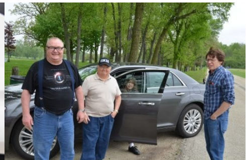
All six hunting teams made it to the foxes location in the required two hours