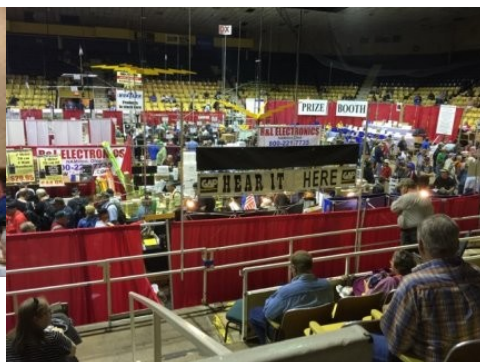
A small corner view of the main arena at Hamvention