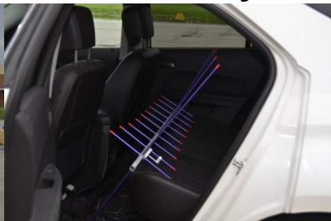
The WU9D secret weapon...oh well, there's always next time