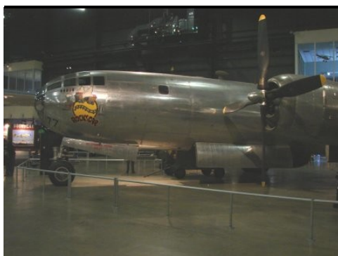
The famous Bockscar. The B-29 that dropped the nuclear bomb on Nagasaki ending the most devastating war in history. The stunning destructive power of the bombs ironically saved over a million lives by making an invasion of the main island of Japan unnecessary.