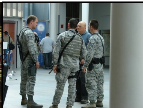
Heavily armed security personnel patrolled the US Air Force Museum