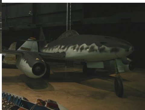
The Nazi ME-262 The world’s first operational jet fighter