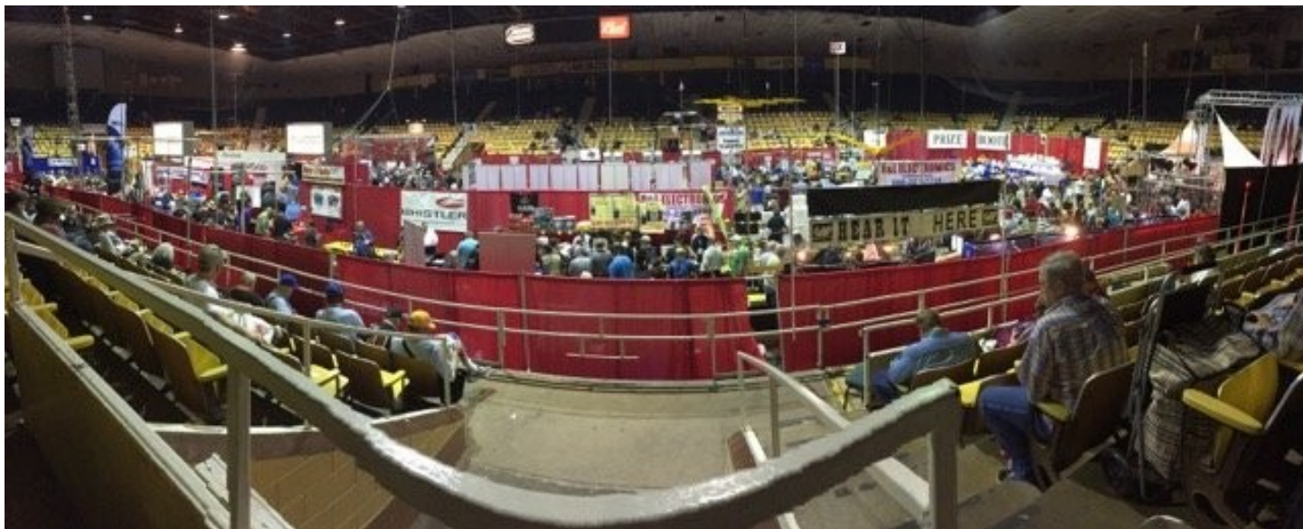
A “fisheye” panoramic view of the main arena at the Hara Arena complex