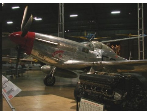
An American P51 Mustang Absolute ruler of the skies in World War II