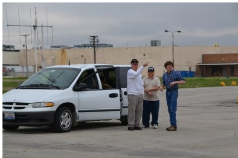
"Elite" hunters gather for the hunt