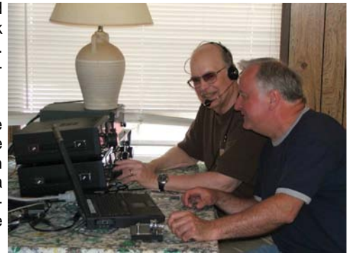
Dynamic-duo AK9F and K9NR, winners of the 2006 Indiana QSO Party go for the gold in 2007!