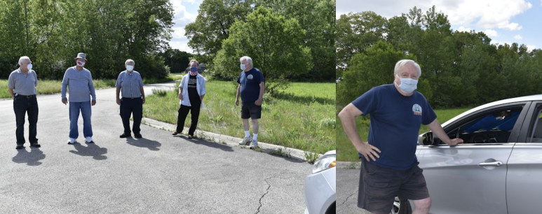
Hunters gather at the starting point