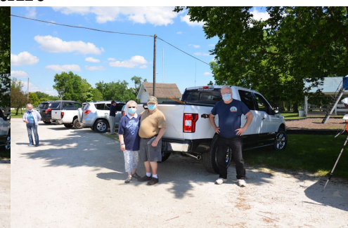
K9NR in the foxes lair