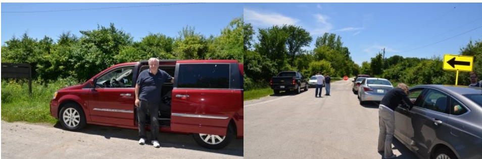
Don K9NR finds that being first to find the Fox doesn’t count, it’s all about the mileage. The picture on the right shows the lineup of cars who all arrived at the Fox’s location where 3000 W. Road dead ends just north of the river, near Davis Creek.

See you at: Field Day! Transmitter Hunt! KARSFEST! Two Rivers Century Bike Ride!