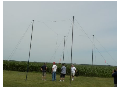
The completed Moxon ready to make Q's!