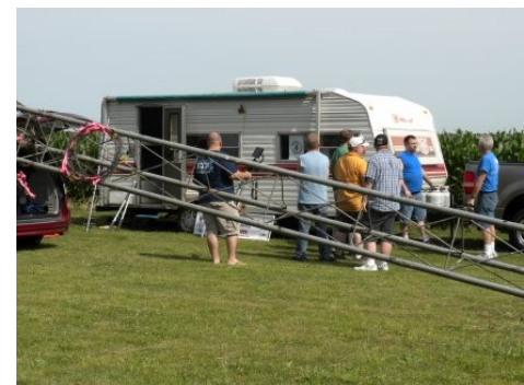
Antenna crew confers prior to hefting the tower in place