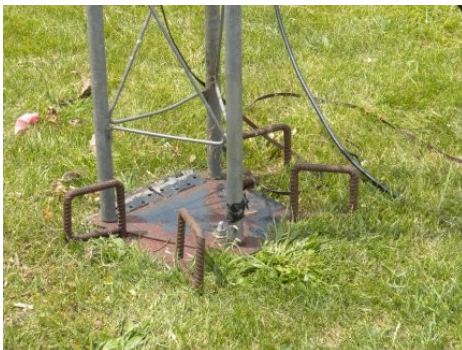
Close-up detail of the custom made tower base plate