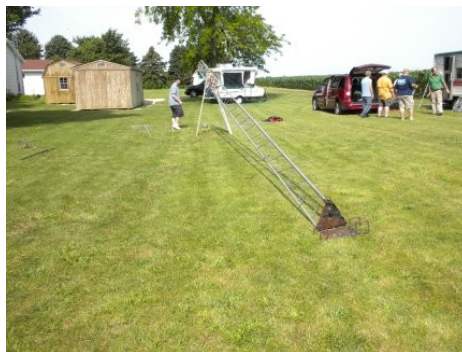
Prepping the VHF/UHF tower