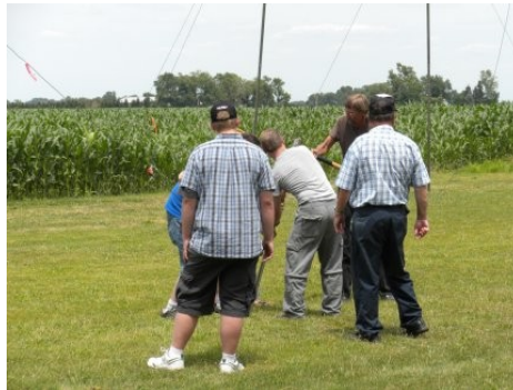
Erection of the 20 Meter Moxon antenna