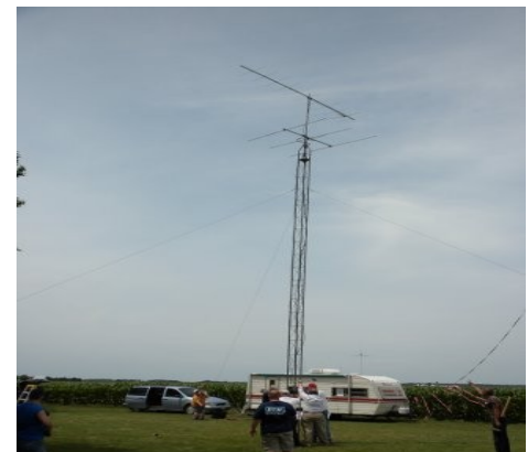
Tower and antennas alongside KARS EmComm unit