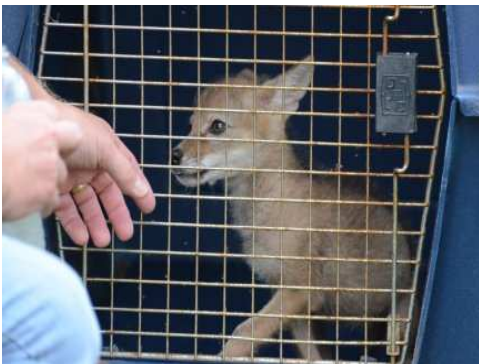
Don KC9QPM brought out a mascot for KARS FD...a very young coyote pup.