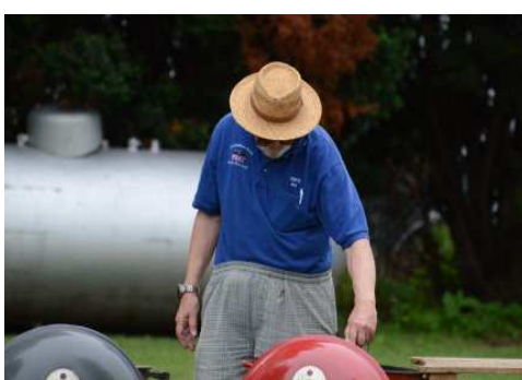
Master steak chef Will K9FO busy at the grills cooking the worlds greatest steaks