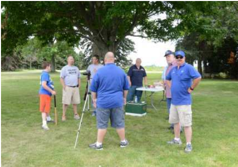
Some of the KARS FD crew standing by for the "Greatest spectacle in Ham Radio!"