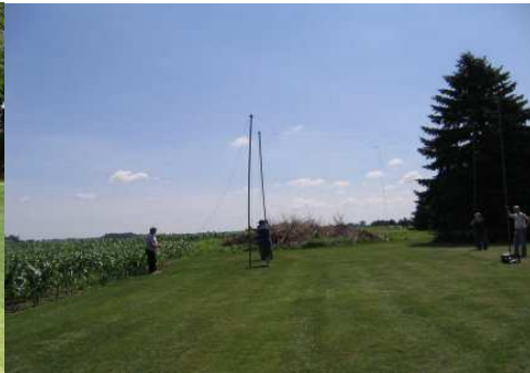
Erection of the 20 Moxon antenna...new this year at KARS Field Day operation