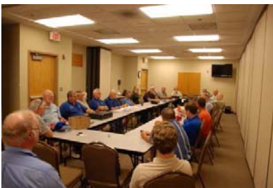
Planning Field Day 2011 at the June KARS meeting

Let us know if we miss your birthday or get it wrong.