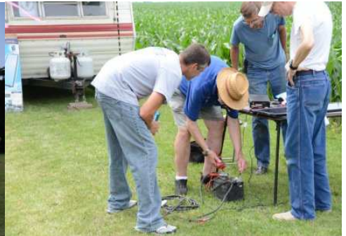
Will K9FO and others working on the successful natural power source contact