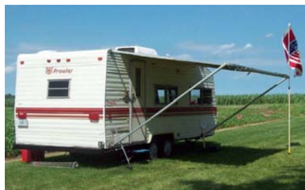
Field Day! The new KARS EMCOMM trailer at Field Day 2010

The net meets every Monday at 2100 hours local time. Don't forget the net!