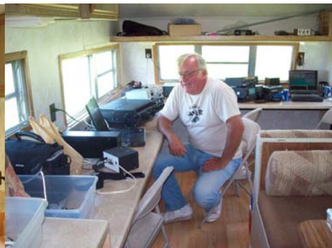
K9NR, CW operator, sits among the multiple operating positions in the EMCOMM trailer.