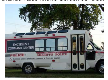
Kankakee County Incident Command Vehicle