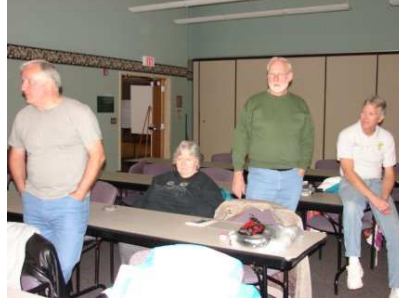
The Montserrat crew give a brief accounting of their DX operations