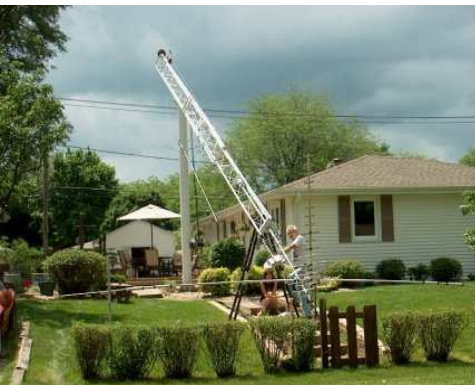
ANTENNA PARTY W9YNI STYLE