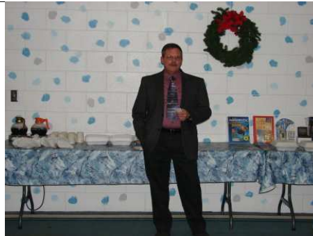
KARS president WD9AYI gets the attention of the crowd when he announces the commencement of the prize drawing