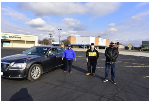
Some of the hunters at the start on a chilly but pretty sunny day

A very popular activity for many in an otherwise dismal year