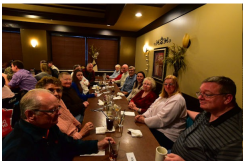
Some big smiles there!

A great evening, wonderful people & prizes