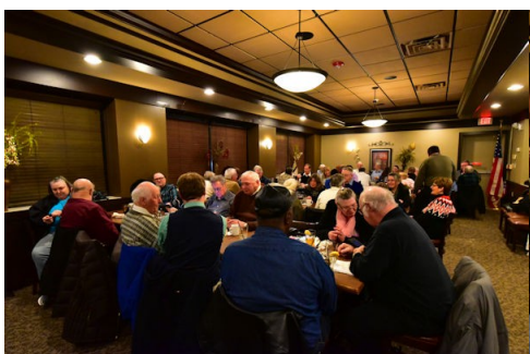
A house limit crowd!