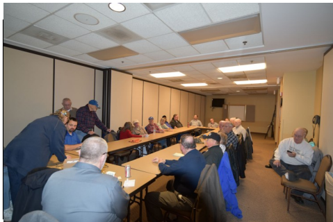
Taking care of business at the December KARS meeting