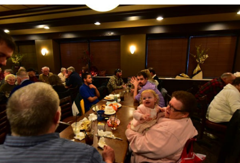
Little ones had fun! What's her code speed?