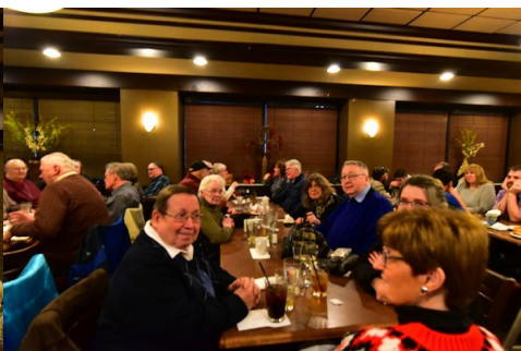
WA9WAQ enjoying the evening