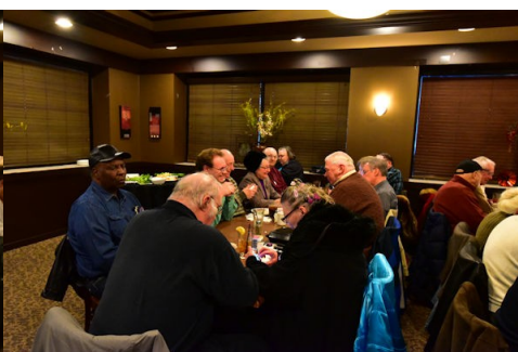
The table closest to the prizes!