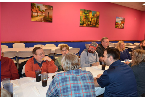
That's a lot of smiling faces