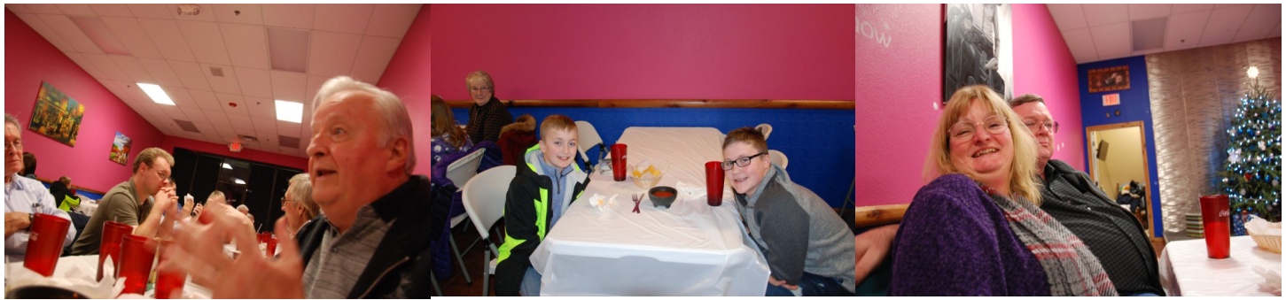
We hope you were able to attend and had a safe and happy new year!