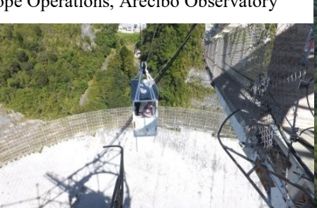
That's Val NV9L in the basket taking the ride from the antenna feed back to the ground