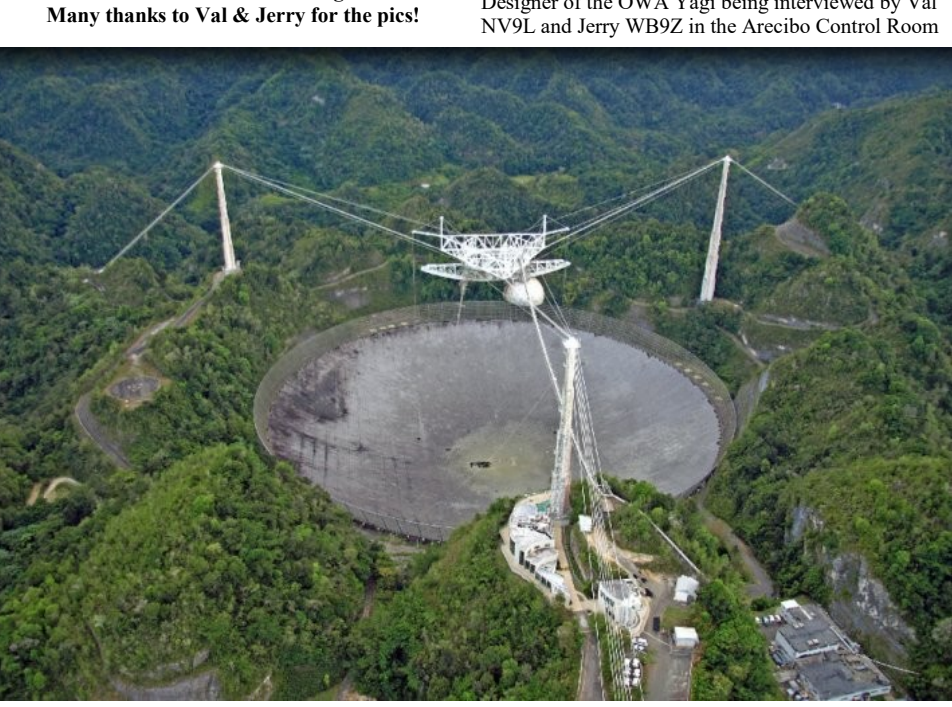
The incredible Radio/Radar Astronomy in Arecibo, Puerto Rico The dish is slightly over 1,000 feet across. The antenna feed, weighing over 900 tons is suspended by cables nearly 500 feet in the air. It was from this antenna feed assembly that Jerry and Val took photos and videos.