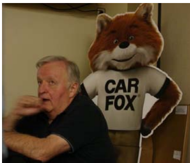
KARS car fox chastises Don K9NR for yawning.

A good program really makes for a good meeting! So what's your idea for a good program?