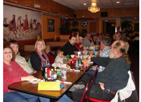
More of the gang hungrily waiting for their food. "Muy Bueno!"