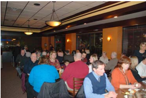
The KARS crowd at The Brickstone looking left...