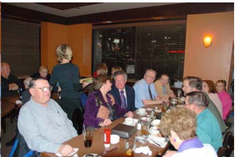
KARS folks sure know how to have a good time!