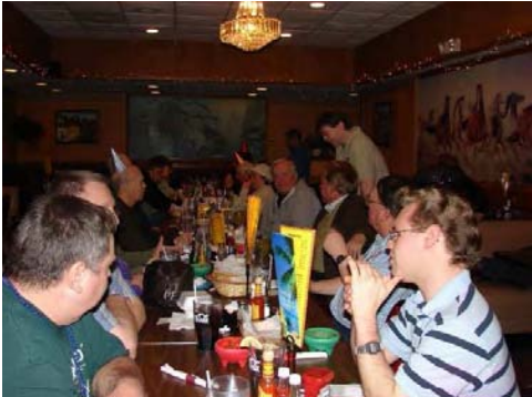
News Year Eve at El Campesino's and the living is fine for this group of KARS members