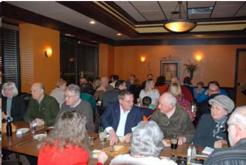
The KARS crowd at the Brickstone looking right...