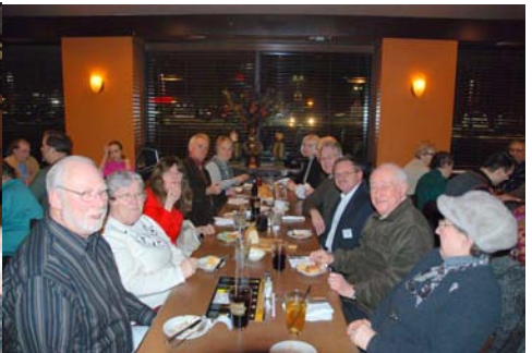
Down the middle!