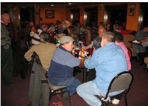
A view from the other end!