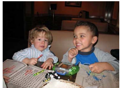
New KARS officers? Not yet! Future hams discuss highly technical issues regarding their favorite crayons