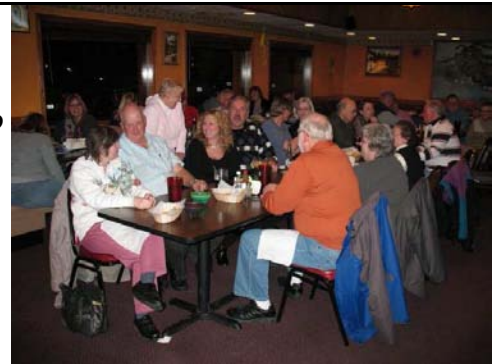
A partial view of the KARS News Years Eve dinner at El Campesino

All went well and everyone had a great time!