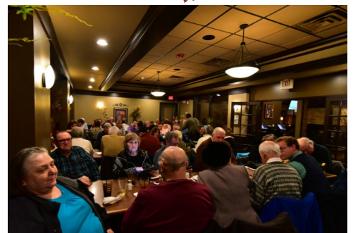
2018/2019 KARS Banquet pic [archive]

SAMPLE ballot—Actual ballots to be distributed at December general meeting