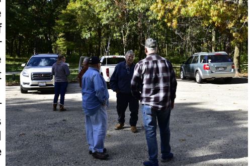
Hunters gather at the October 19th hunt