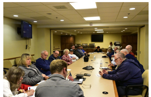
KARS November general meeting