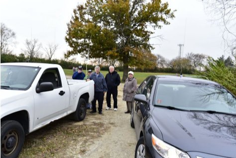
Hunters gather at the foxes lair