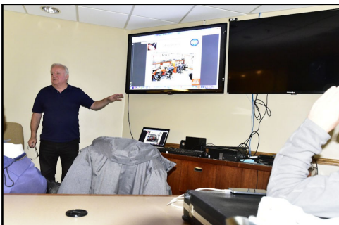
K9NR's presentation on Contesting at the November meeting