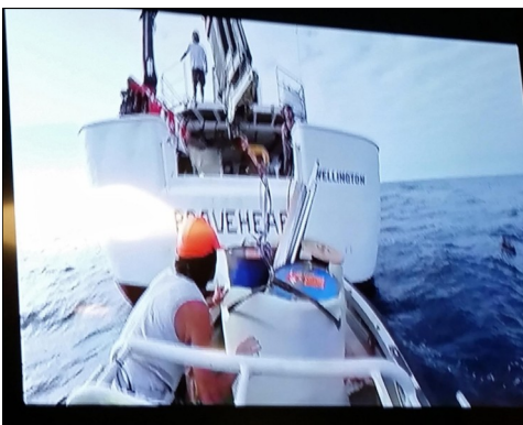
Offloading barrels of equipment and supplies from the Braveheart for the FT5ZM Amsterdam Island DXpedition in the faraway Indian Ocean

More nominations for all positions are allowed right to the election.