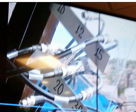
A view of the antenna patch panel use at FT5ZM - K1N and other DXpeditions, constructed by Clay N9IO. It has traveled to remote regions of the globe.

Nov program photos with Jerry WB9Z - Amsterdam Is FT5ZM