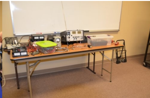
Test equipment for tune up night