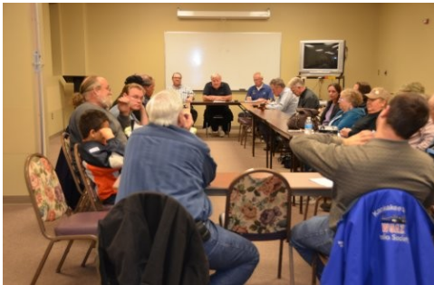
Business meeting prior to program