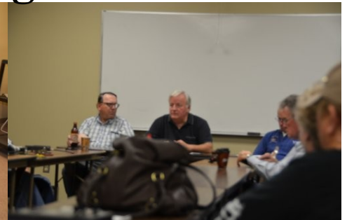
Taking care of business