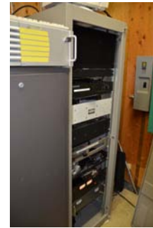
444.8 Repeater 144.390 APRS Digi-peater W9AZ-1 145.530 DX Cluster