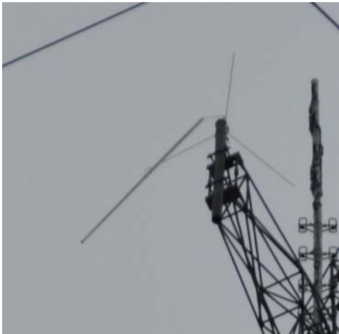
Tornado damaged remote repeater receiver antenna on the Diamond tower Story on page 3

***Change of Venue: It has been decided to hold a January 7th general meeting and cancel the Jan board meeting.