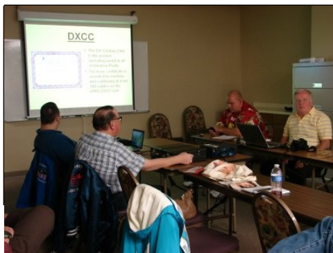
The program on DXing at the November KARS meeting

After the mundane but necessary tasks are completed, there will be an interesting program on antennas and feedlines. Have you ever wondered why an antenna radiates? Have you ever wondered why everything is based on 50 ohms and not 100 ohms and what does RG and BNC stand for? Come to the December KARS meeting and find out these mysteries and more. See you there!