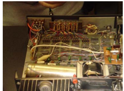
Inside look at Ken's freq counter