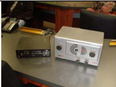
Left is W9YNI's S38C Halicrafter rcvr and a digital freq counter he built back in 1972