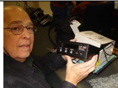
At right AK9F shows an LP-100 digital vector watt meter (story continued on page 2)