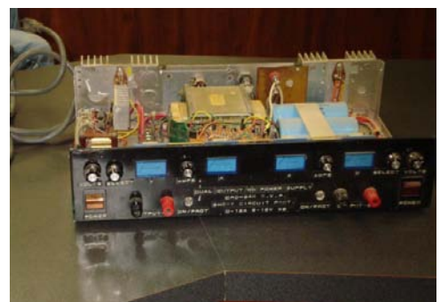
El Presidente Bill N9OE showed a dual voltage power supply he built sometime back in the 90's