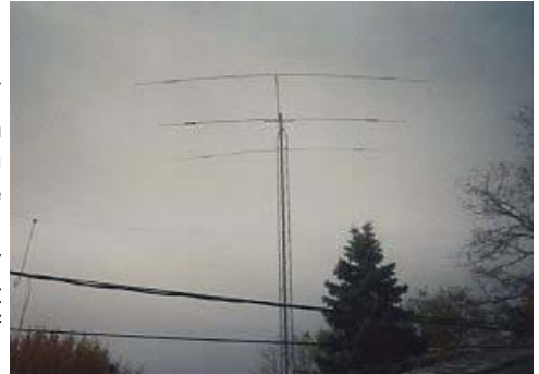
Antenna project finally completed K9KOC MP-33 Triband beam