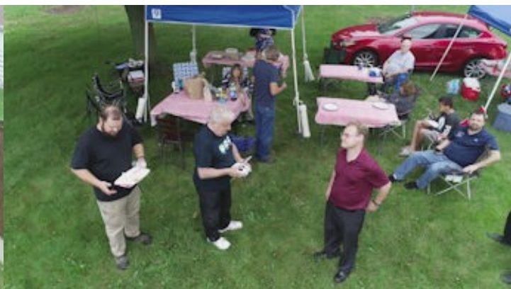
The most popular area of Field Day ...the dining area!