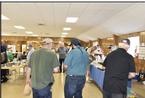
Keeping dealers busy at KARSFEST

August 6 KD9CGC August 13 K9KSG August 20 N9OE August 27 N9LYE Don't forget the net!