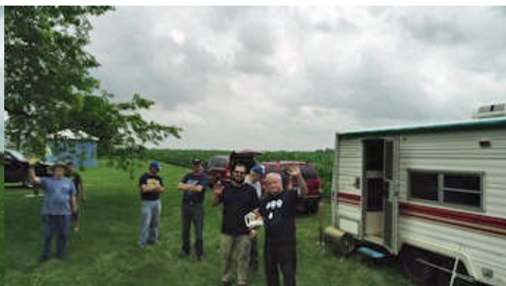
Part of the antenna crew at the EMCOMM trailer