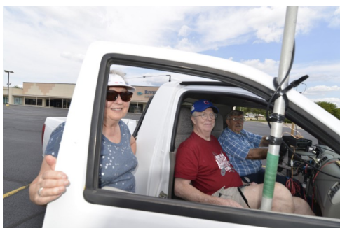
July 28 Foxhunt