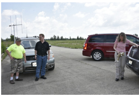
June 30 Foxhunt

KARS HOMEPAGE— WWW.W9AZ.COM —KARS HOMEPAGE