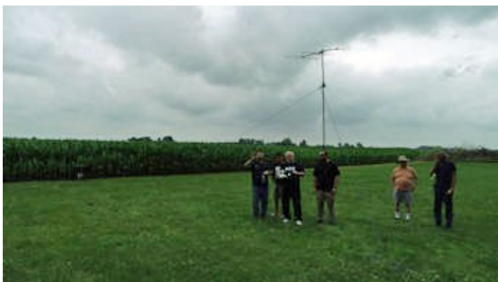
Erecting the 6 meter Yagi