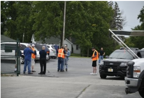
Manning the gate at KARSFEST