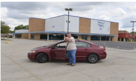
KD9GHM...new ham...first time hunter

The next foxhunt will be held on Wednesday August 3rd at 5:30PM If you've n hunted you can ride along to see how it's d o