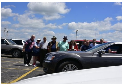
Group photo at the start