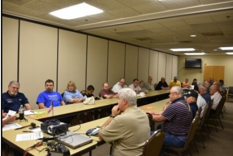
KARS July meeting