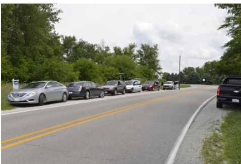
Hunting teams lined-up at the foxes lair 6 waiting for the remaining hunters