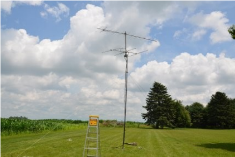
Sections of fiberglass poles g i d d c f h ] b [ ' h \ Y ' * ' U b X ' K ] ' ' Ð g ' [ c c X ' W c c _ ] b [ "