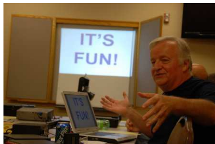
CW IS FUN.

August 1 KC9FAV August 8 N9LYE August 15 N9FD August 22 N9OE August 29 N9FD