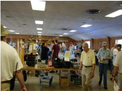
The main air conditioned main hall provided cool comfort for those, looking for bargains at KARSFEST