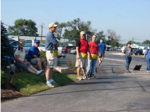
KARS members taking their turn at manning the gate