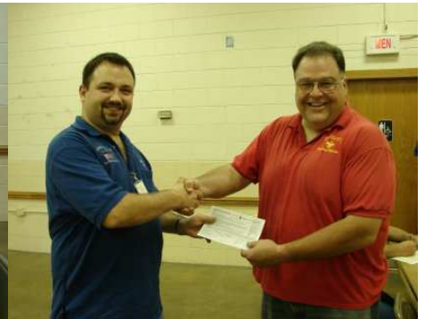
KARS president N9OE congratulates a successful candidate who earned his Extra at KARSFEST.