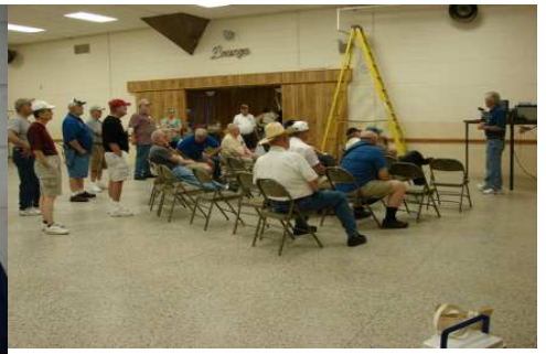
Forum audience eager to learn all they can about Flex Radio