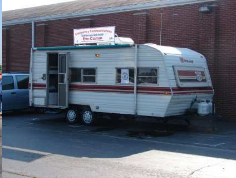
KARS EM-COMM unit housed the talk in station for KARSFEST.