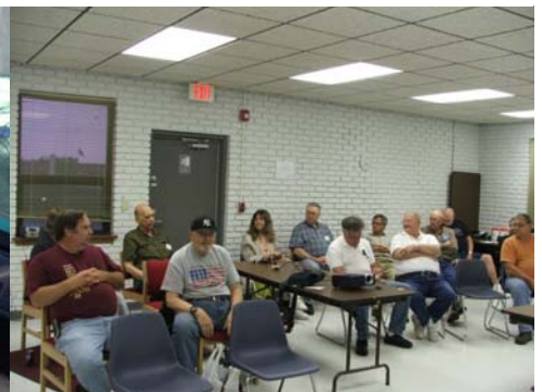
The gang gathers for the July meeting inside the new Red Cross headquarters in Bourbonnais. The Winlink program garnered much interest.