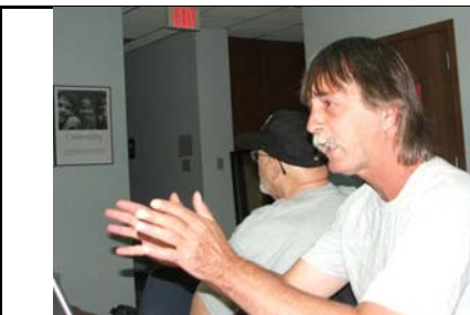
Art N9ZZK presents Winlink program at July meeting

There will be a very minimal meeting...mostly just good conversation and fun. See you there!