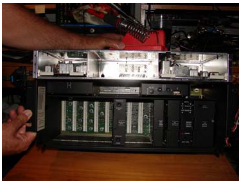
A view of the new Motorola MSR 2000 444.8 Repeater