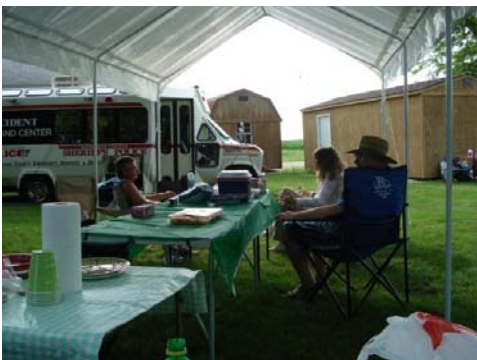
A quiet evening moment at the dining tent.