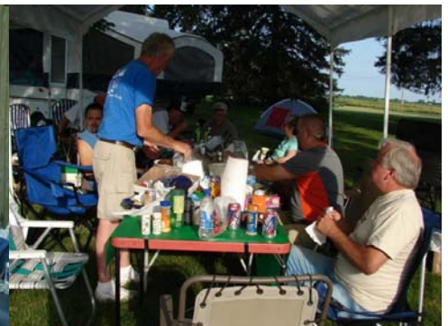
A busy dining tent! The most important activity at Field Day...the dinner cookout!