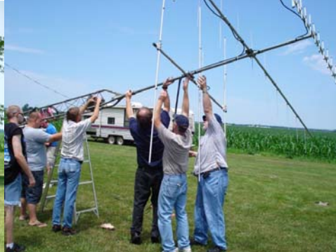
All hands and the cook! Getting the tower ready for the old "Heave Ho"