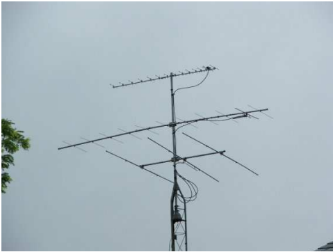
Skyhooks for 6 & 2 meters & 70 centimeters