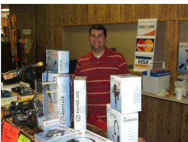
If I don't have it, you don't need it!