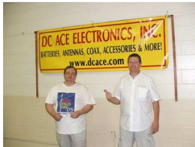
We love the KARS Hamfest!