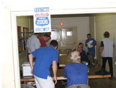
New hams being born at the exam session!