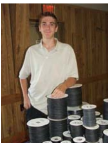
Need some antenna cordage?