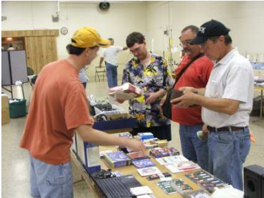
Will ya take five bucks?