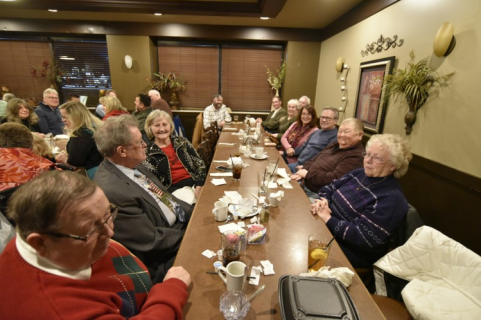
Photo from the January 2020 KARS Banquet pre Wuhan China plague event.

If we miss your birthday or get it wrong, please let us know!