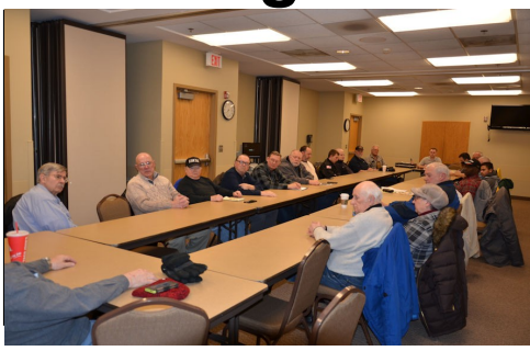
The March KARS general meeting followed by a program on storm spotting and severe weather