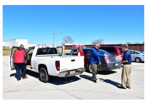
Arriving hunters greeted by the Fox N9FD