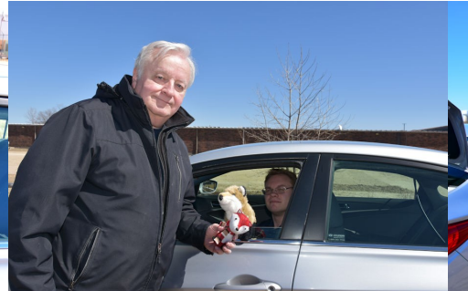
Winner K9NR at the Fox's Lair