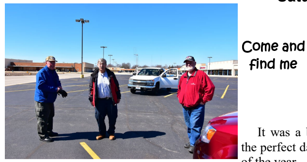
Ready at the start...KB9VR, N9DWE & N9HJR