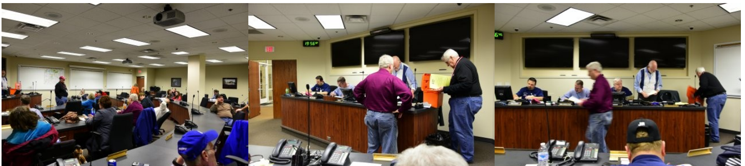
Examiners and Examinees...a lot of hard working people—Quiet please!