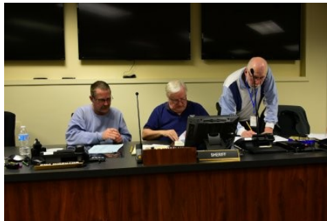
Carefully checked answer sheets

Participating VE's include K9CS (VE team liaison), W9LIZ, K9NR, K9QT, N9OE, N9RJM & W9TRF.