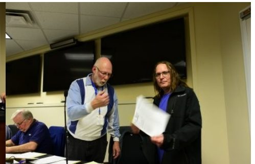
K9CS presents KD9CFX with his CSCE for his Extra Class license