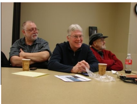
N9IO, WR9L and K9FO enjoy the program at the March KARS meeting

If we miss your birthday or get it wrong, please let us know!