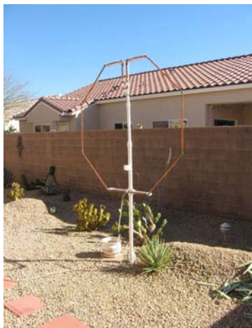
WB9RUE's magnetic wave antenna in the Arizona desert

I understand that the ham station is manned by one of three volunteers who hurry in when severe weather is in the forecast. There are 2-3 stations that are open if needed in severe weather. My overall experience of my visit to the National Weather Service Forecasting Service in Chicago was outstanding! It helped me make the decision to pursue a career in meteorology.