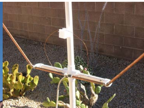
The feed point