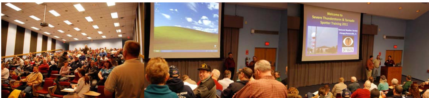
A nearly standing room only crowd at the NWS severe weather seminar in the KCC auditorium

KARS HOMEPAGE— WWW.W9AZ.COM —KARS HOMEPAGE